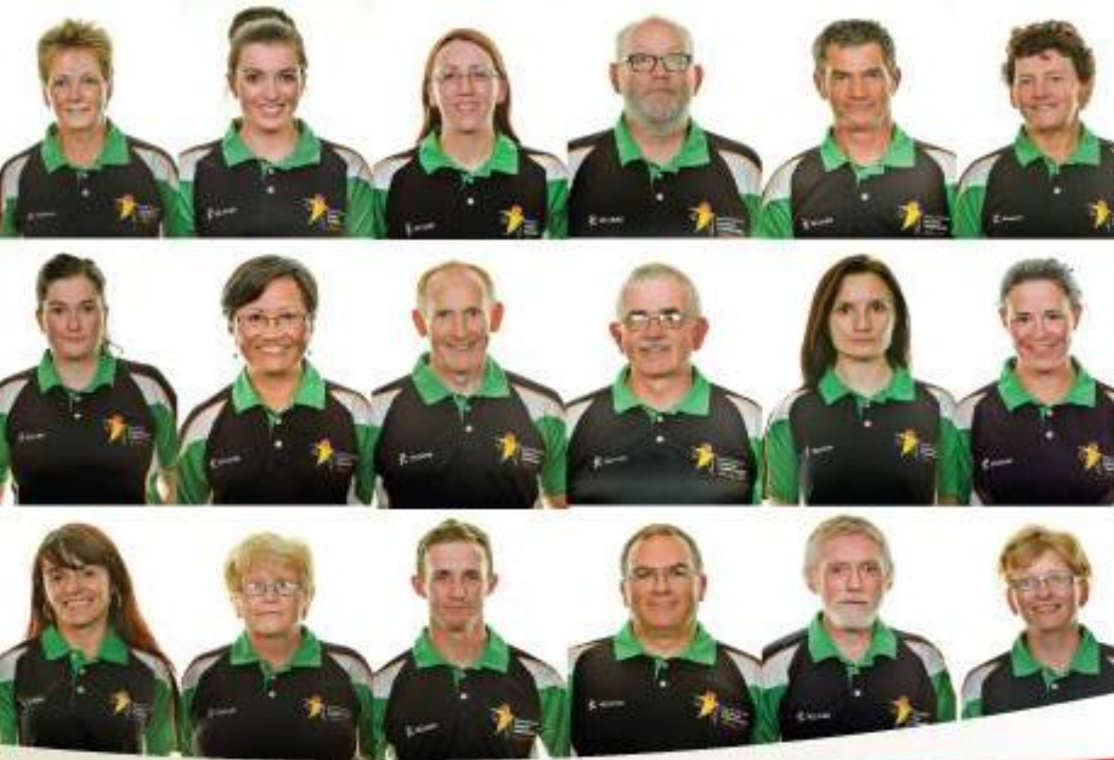
Team of Head Coaches and Management Team European games 2014